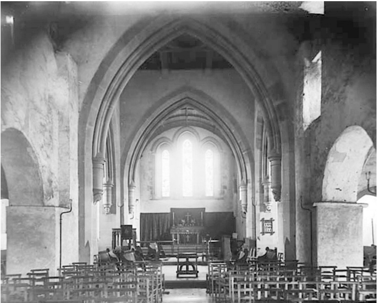
Interior 1885 facing east

The West Wall, Crossing, Transepts and Chancel are Victorian, dating from a restoration completed in 1884 [Gover chapter 13, photographs p 155].