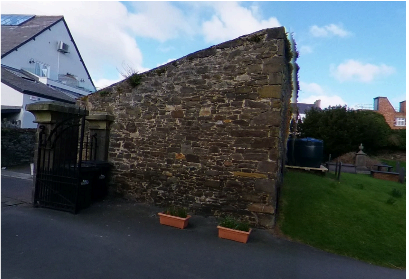
Image of proposed wall location for interpretation board at the West gate entrance to the churchyard