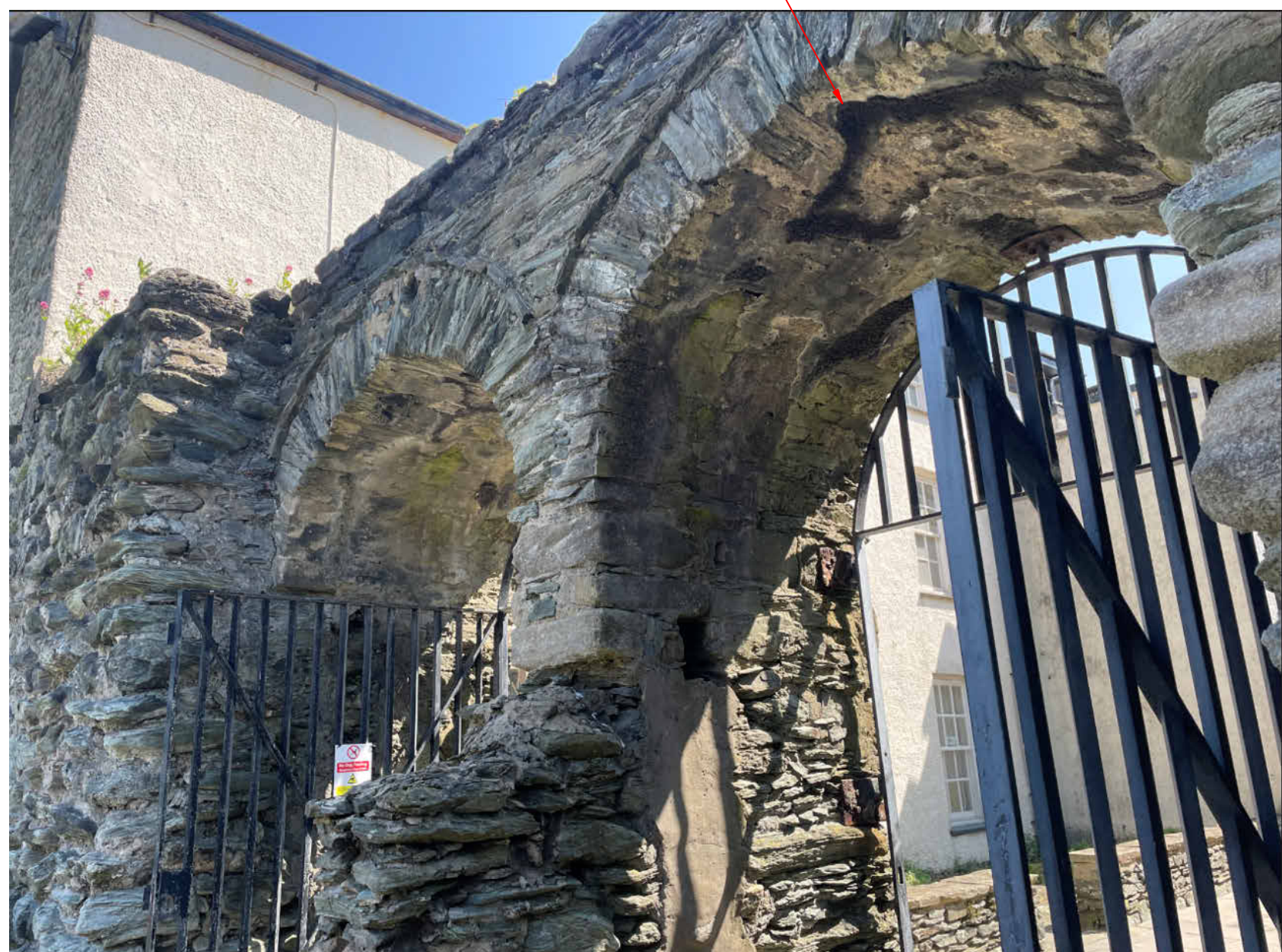
VIEW FROM NORTH

REMOVE RENDER AND ALL DEPOSITS TO ARCH SOFFIT AND ALLOW FOR RAKING OUT DEGRADED MORTAR AND DEEP REPOINTING