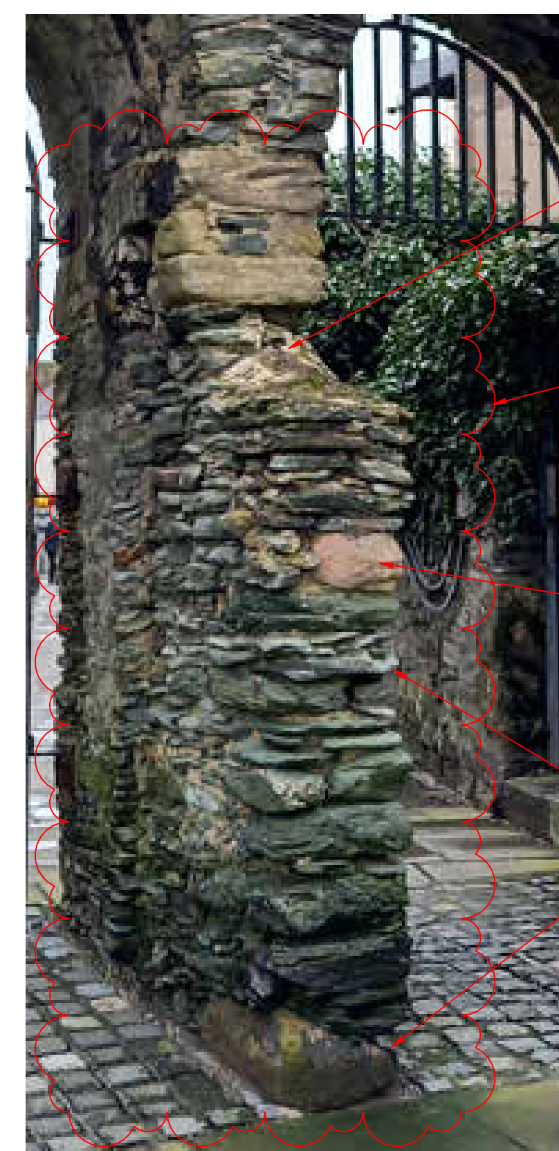
VIEW ON PIER FROM NORTH

REMOVE EXISTING CAPPING, REBED LOOSE STONE AND FORM NEW MORTAR CAPPING