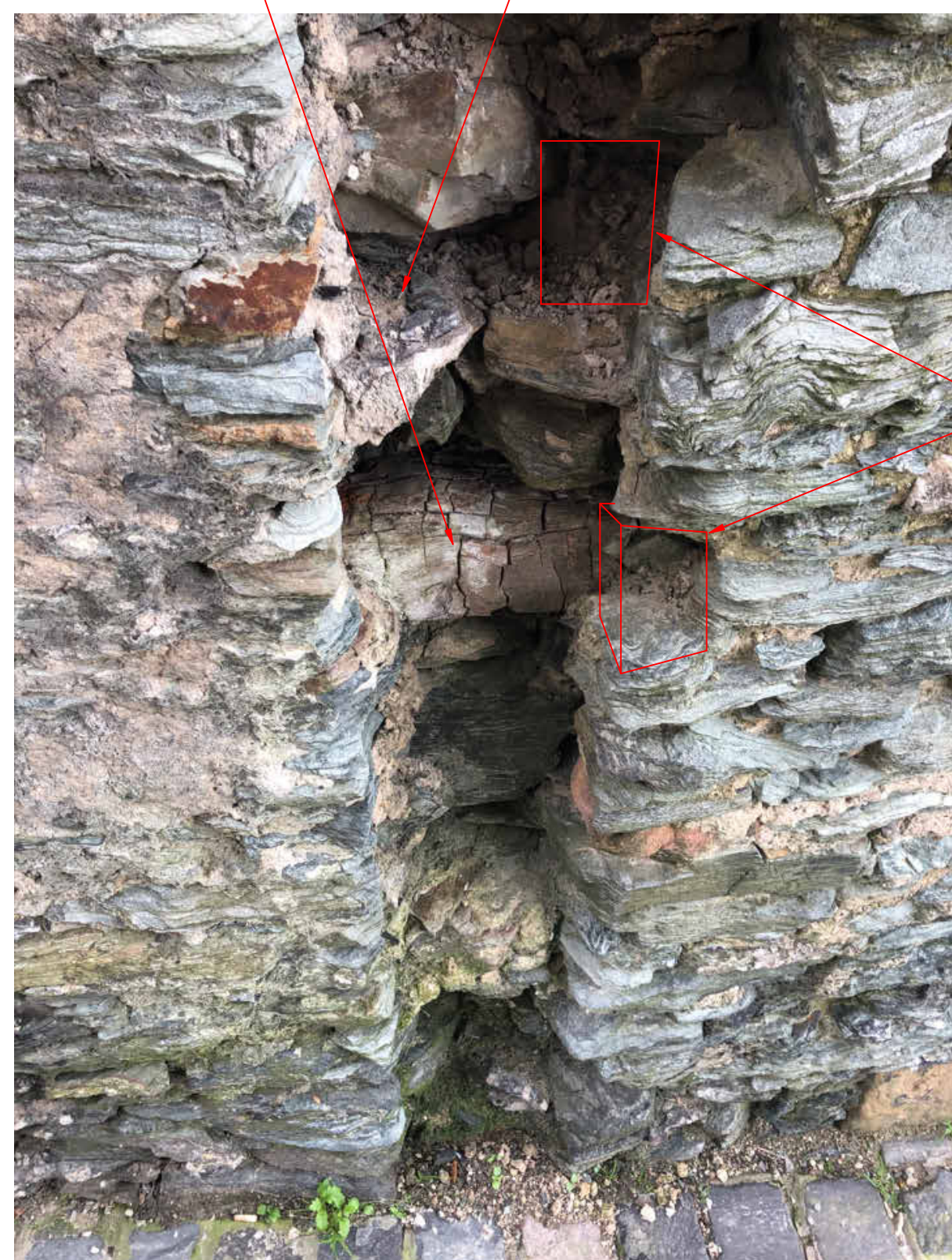
VIEW ON TYPICAL REBATE (SIMILAR ON 4 FACES)

DEEP POINTING TO REBATE. MAINTAIN SHAPE OF REBATE