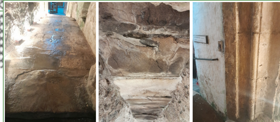
Passage: Area of recent water ingress Photographs from site visit January 2024.

Nave: Other timbers in south-west There are signs of wood boring insect to areas within purlins, and to uprights, but timber members do not appear significantly compromised or loose. Unsure if insect is active or not. No significant or obvious signs of water ingress from lift position to either area. (Action required to investigate timbers).