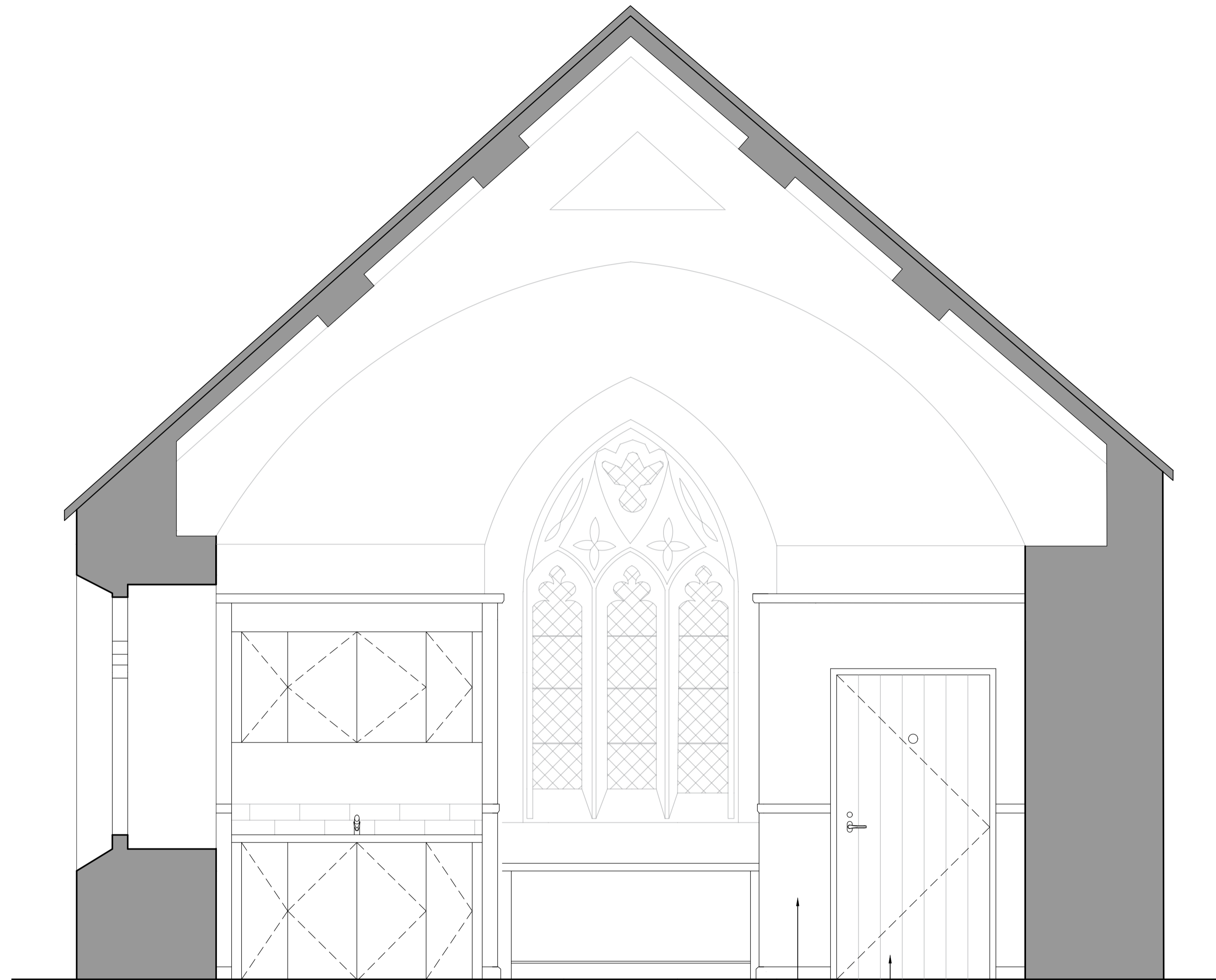
Section CC As Proposed Scale 1:20 @ A1