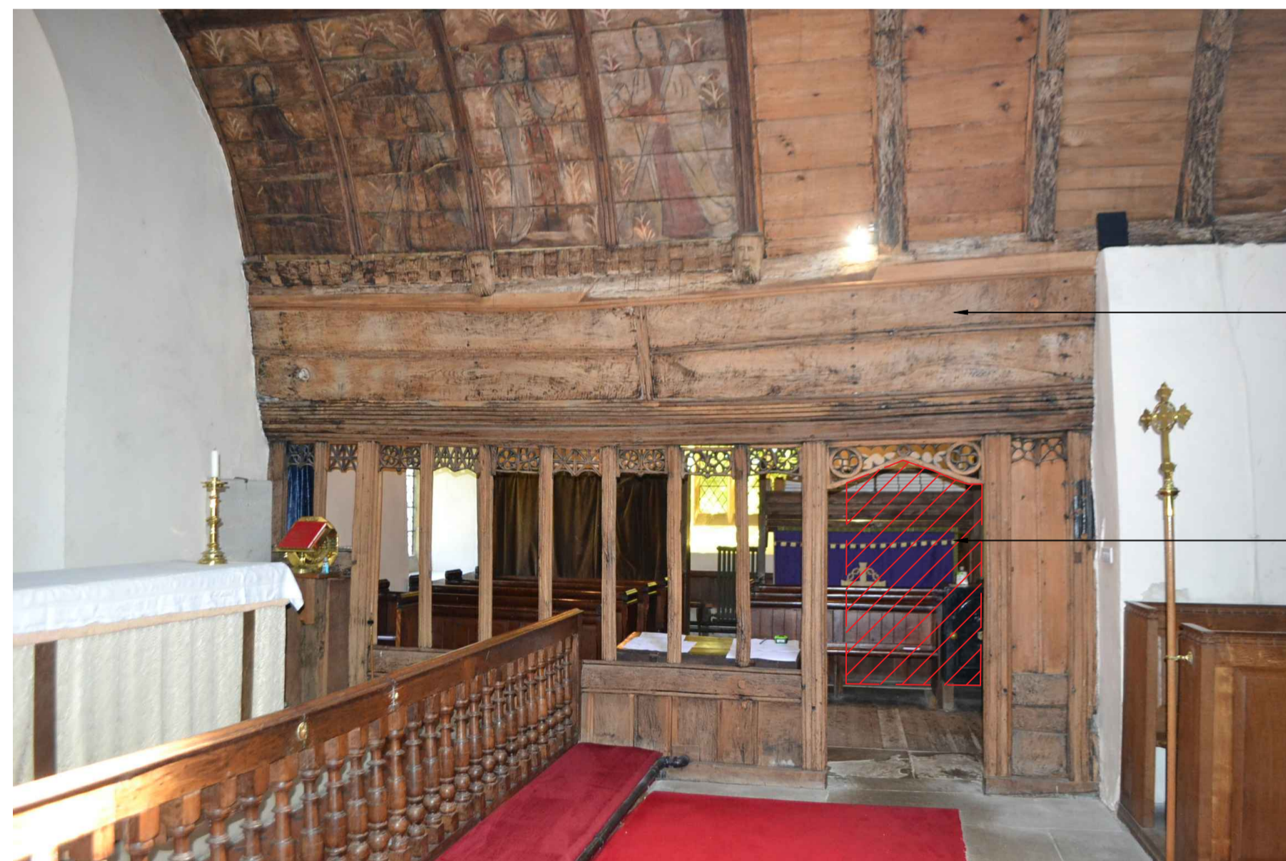
Photograph from Nave Not to scale